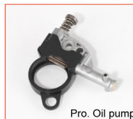
Pro. Oil pump

Recommended for tough semi-professional (Farmer Class) usage. Ease of use combined with comfortable handling and exceptional durability.