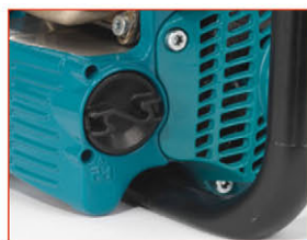
Large, easily accessible tank caps