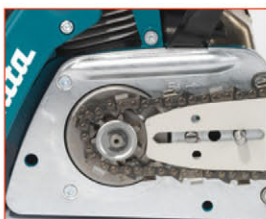
The externally mounted sprocket makes fitting the chain simple and uncomplicated.