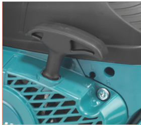
Easy Start: Spring assisted starter combined with optimized engine management