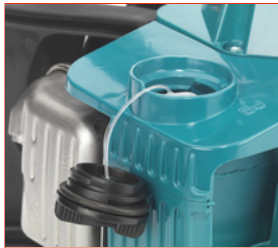
Nose device keeps tank cap away from hot engine parts