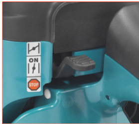
Touch&Stop one lever operating