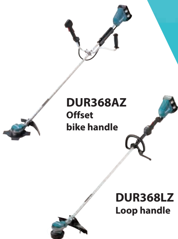
DUR368AZ Offset bike handle